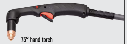
75° hand torch

(for more torch options, see www.hypertherm.com )