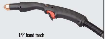
15° hand torch